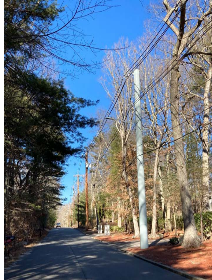
Laten Knight Road